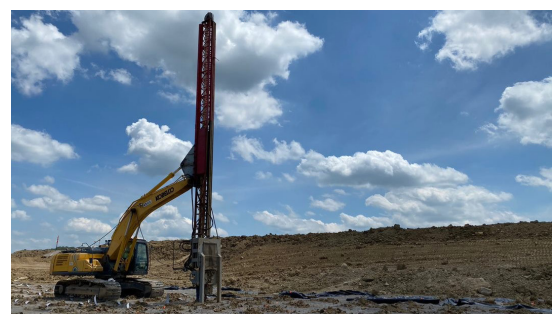
Turnstile Data Center (USA)